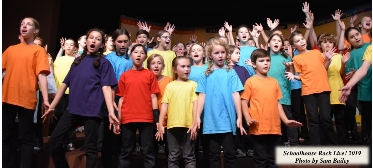
Join us as we teach young people the importance of practicing Accountability, Respect, Integrity, Excellence and Leadership (A-R-I-E-L).

ARIEL Theatrical is committed to helping young people learn to lead principle-centered lives.